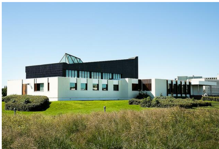
Figure 1: Norræna húsið / Nordic House

Any questions, comments, concerns? Please email pr@seeds.is