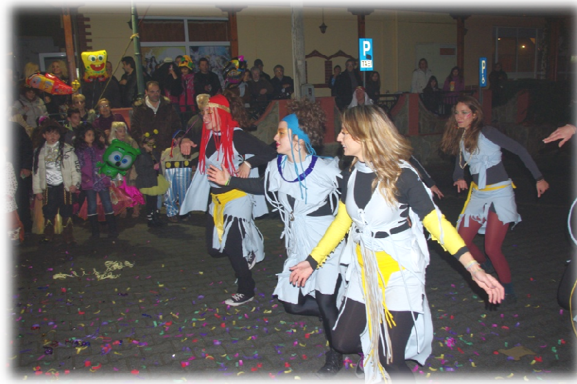
FCIGL: 3rd meeting, Paris 4-5 June 2013