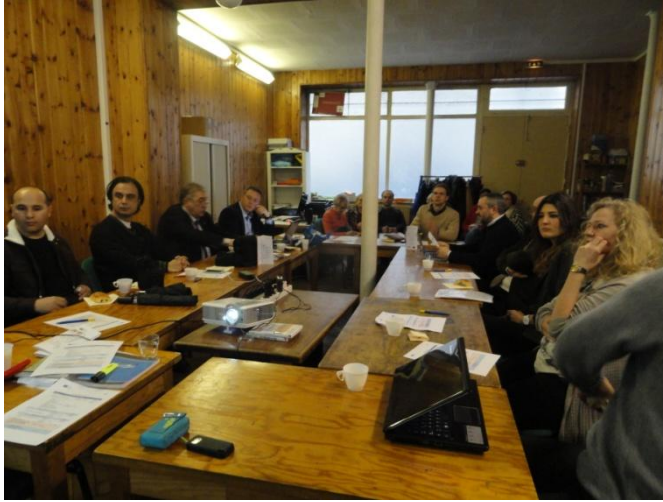
Second Consortium Meeting GAMES in February 2014 in Paris.