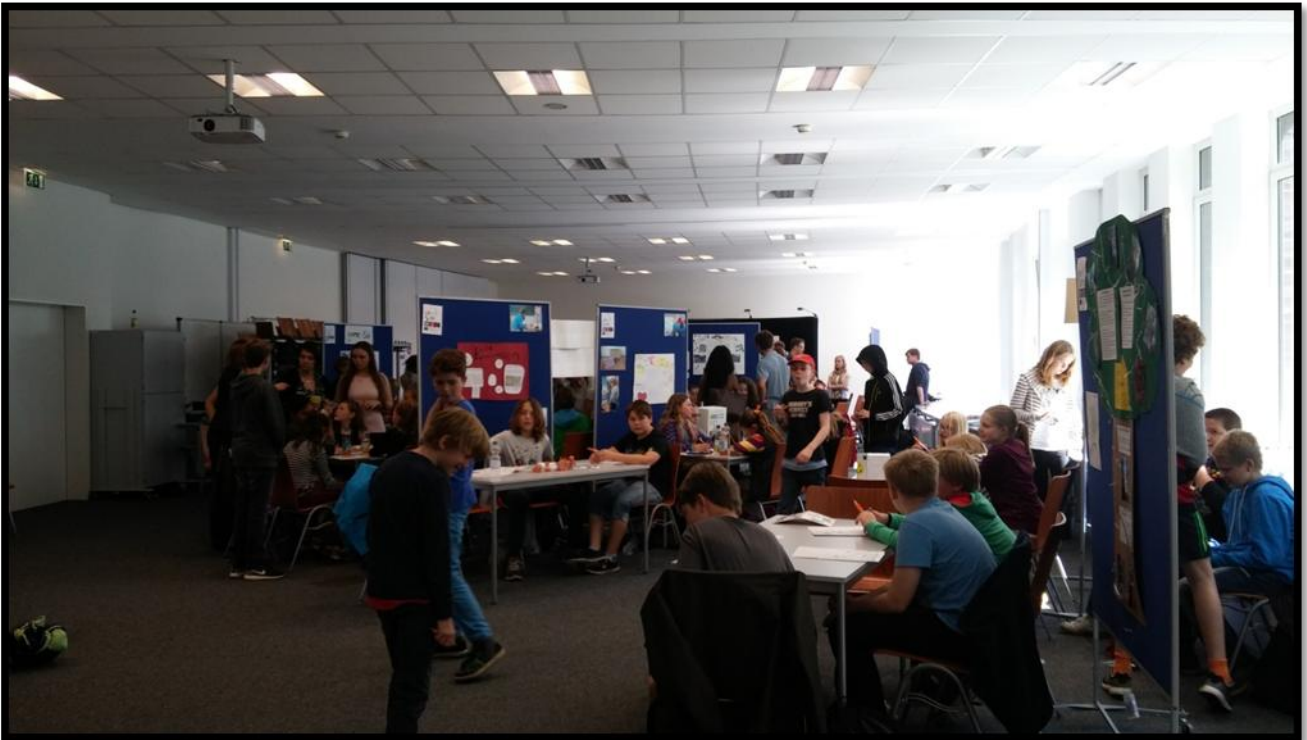
2) Innovative tools: Presentation of participative digital tools by students of the media-informatic program of the City University of Applied Sciences Bremen (HSB)