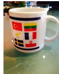
Project Mug created by the Turkish Partner.