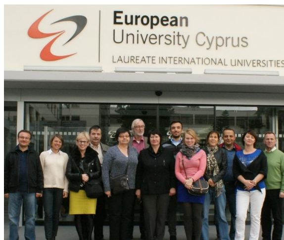
The MoTech Project Consortium in Cyprus (December 2013)

The project partners are educational organisations that come from six different countries from the various parts of Europe.