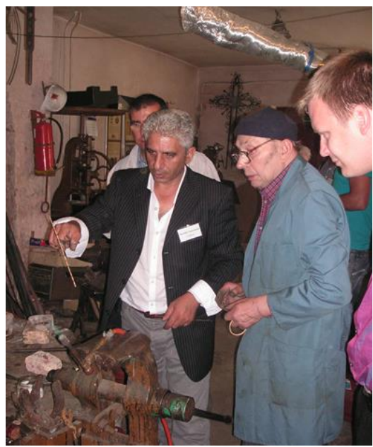
International workshop in smithery museum

The presentations were related to the work that was done in their own institutions during the first year of the project.