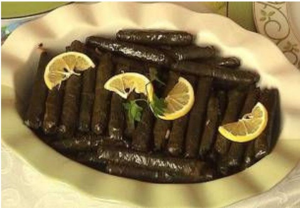
SARMA is a very popular dish in the west of Turkey; these are cabbage or grape leaves filled with minced meat or rice.