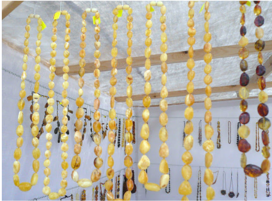
Traditional jewelry made from amber.