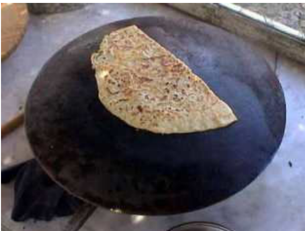
GÖZLEME ; this is a savory pastry made of hand-rolled dough filled with various ingredients and cooked on a griddle.