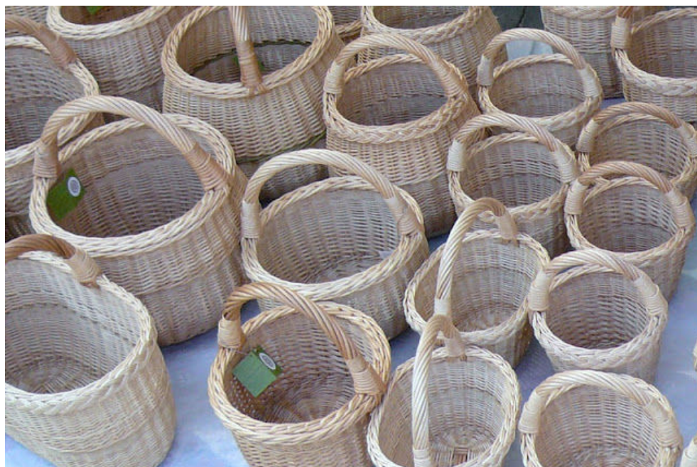
Baskets, made from willow osier.