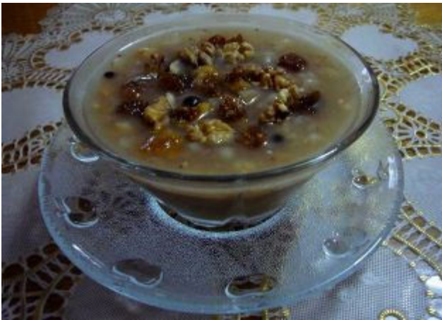
AŞURE ; This is made of a mixture consisting of grains, fruits and nuts.

Of course we cannot forget Turkish delight when we talk about Turkish desserts☺