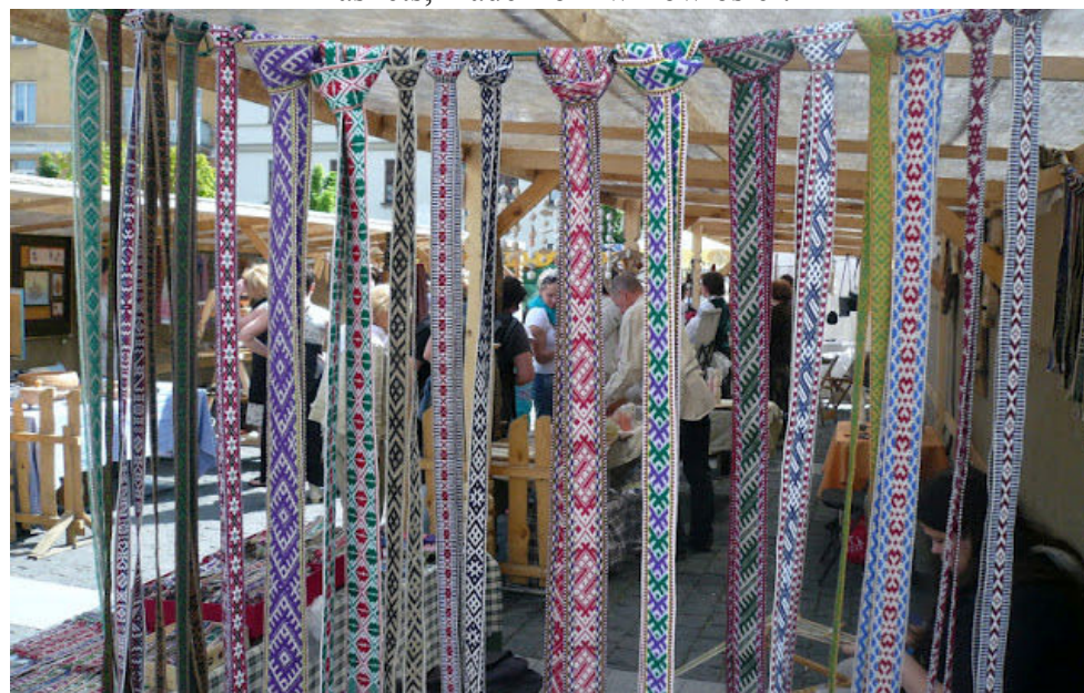
Woven and knitted items of clothes are another tradition. Yet again, each region has their own color set and patterns.