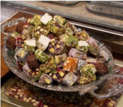
LOKUM (TURKISH DELIGHT) ; It's made of starch and powdered sugar. It has different varieties of shapes and sizes and they are flavored with rosewater, mastic etc. They also consist of pistachios, hazelnuts and walnuts.

Of course we cannot forget Turkish delight when we talk about Turkish desserts☺