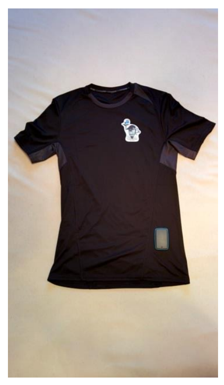
The ALFRED sensor T-shirt

previously defined. All these sensors will be integrated into an underwear shirt using smart textiles. The requirements of low energy consumption and comfort have been considered in order to facilitate easy handling for older users.