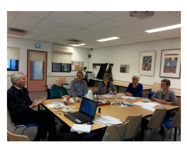
ALFRED focus group session

well as care professionals in the definition of the user requirements and use cases. Older people are actively helping ALFRED to grow into a virtual butler that supports their independent living in the future. Focus groups have been set up in Germany, France and the Netherlands where older people and professionals discussed specific needs in each ALFRED pillar.