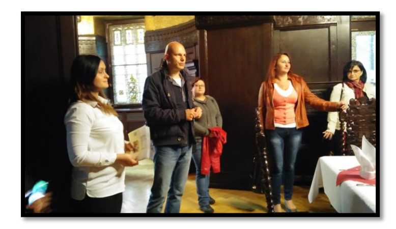
10:00 – 13:00 Tour around Jelenia Gora, Palaces sightseeing