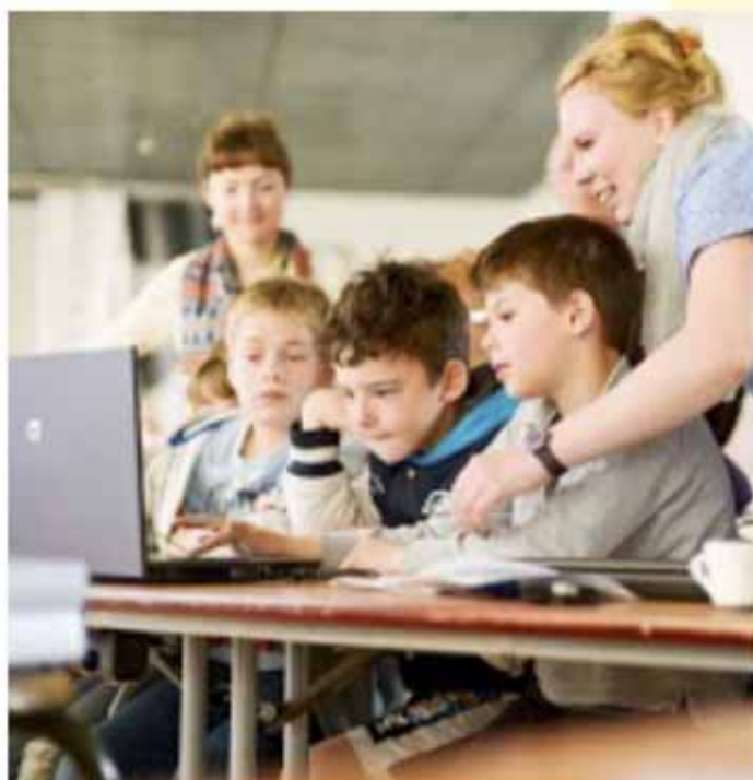
Intergenerational workshop in Paris, 2016