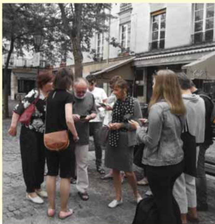
Digital treasure hunt in Paris, 2018