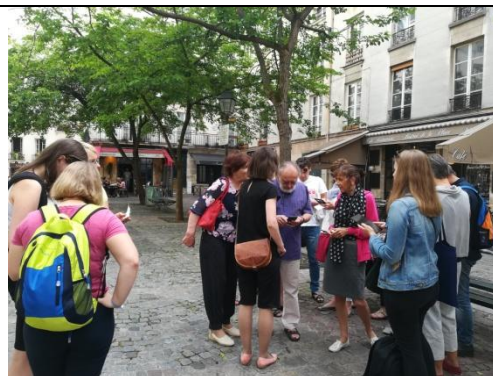
Salsa event co-related with a MOOC about dance